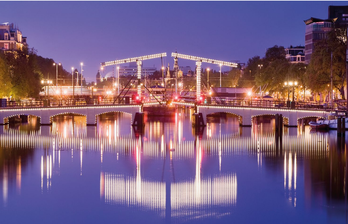
Skinny Bridge, Amsterdam